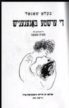
Bella Chagall Burning Lights Memoir First published in France, 1948