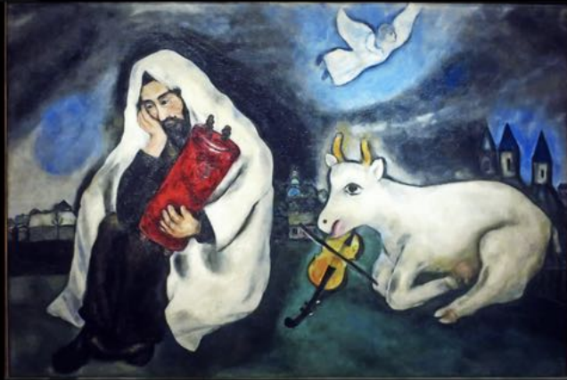
Marc Chagall. Solitude . 1933. Oil on canvas. The Tel Aviv Museum.