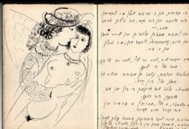
Chagall sketchbook 1942-1965 Musée des lettres et manuscrits, Paris