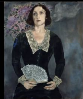
Marc Chagall Bella in Green 1934-35 Oil on canvas Stedelijk Museum, Amsterdam