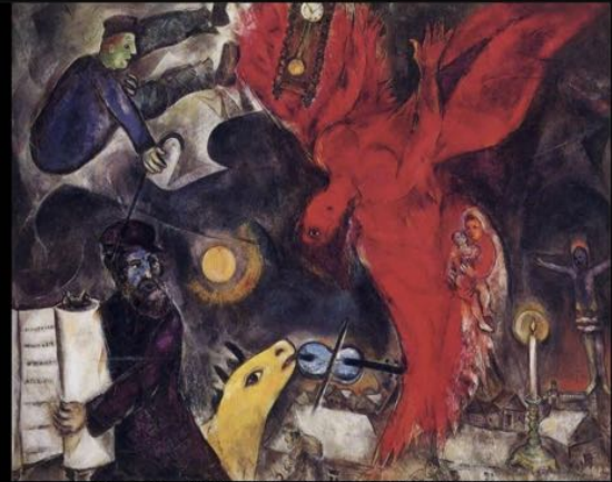
Marc Chagall. The Fall of the Angel . 1923/1933/1947. Oil on canvas. Kunstmuseum, Basel.