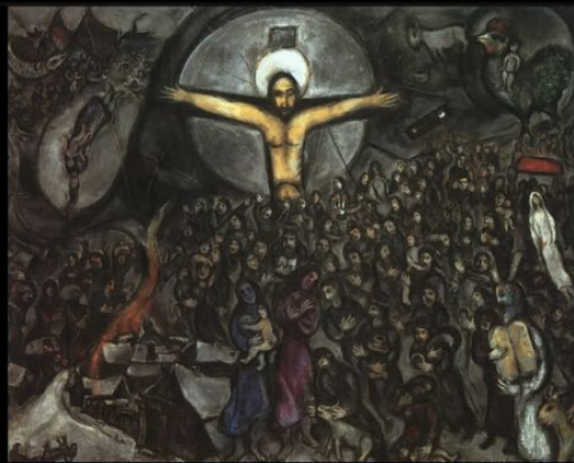
Marc Chagall. Exodus . 1952-66. Oil on canvas. Pompidou Center.