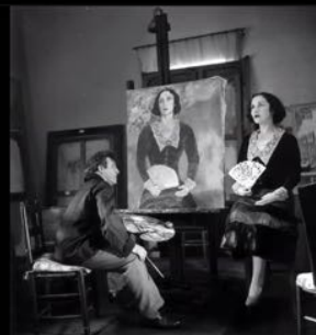
Chagall painting Bella in Green (Bella 1895-1944) 1934-35