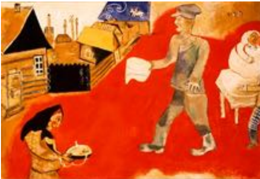
Marc Chagall, Perm, c. 1916-17, oil on canvas, Philadelphia Museum of Art, The Louis E. Stern Collection, 1963, 1963-181-11.

If you would like to participate in this virtual program, go to the CAS website www.AhavathSholom.com and click on the blue bar on the front page to register. The cost for Ahavath Sholom members is $20; for non-members $25. You can make payment by clicking on the website's Donate button or sending us a check (CAS, P.O. Box 464, Great Barrington, MA 01230). Space is limited, so sign up now.