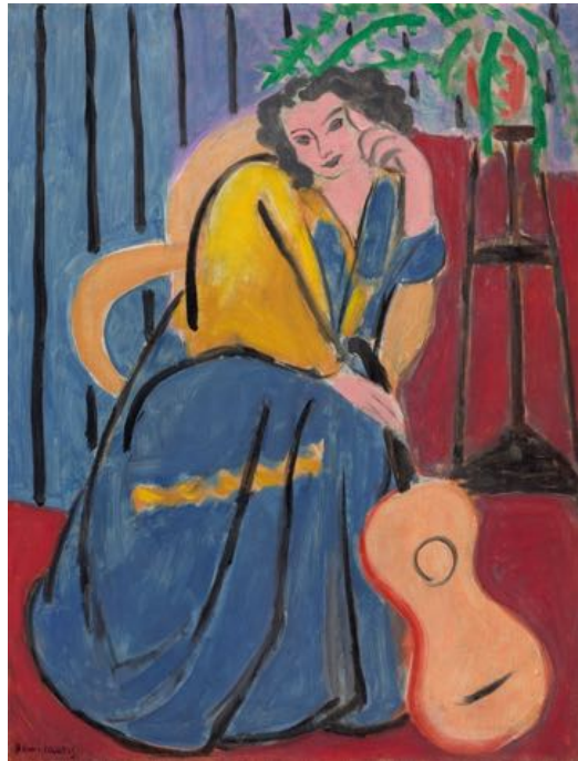
Henri Matisse, Girl in Yellow and Blue with Guitar , 1939, oil on canvas. The Art Institute of Chicago

Afterlives includes works by such artists as Pierre Bonnard, Paul Cézanne, Marc Chagall, Gustave Courbet, Paul Klee, Franz Marc, Henri Matisse, Pablo Picasso, and Camille Pissarro, along with treasured pieces of Judaica, archival photographs, and historical documents.