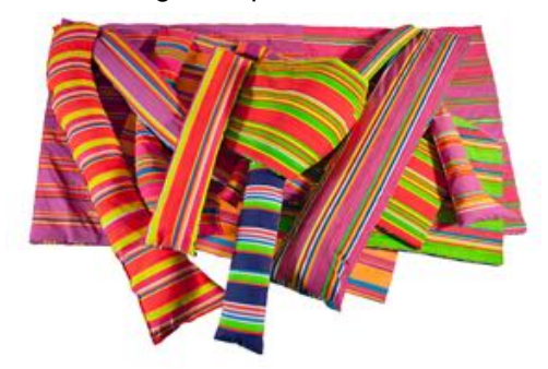
Marta Minujín, Para hacer el amor inadvertidamente

Marta Minujín: Arte! Arte! Arte! Arte!, the Jewish Museum's current exhibit, includes nearly 100 works organized to reflect Minujín's bold experimentation over six decades. This program will take place on Sunday, February 25. The exhibition charts Minujín's influential career in Buenos Aires as well as time spent in Paris, New York, and Washington, DC, through a range of pioneering, mattress-based soft sculptures; fluorescent large-scale paintings; psychedelic drawings and performances; and vintage film footage.