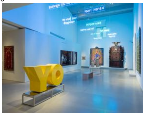
Installation, Jewish Museum Gallery, NYC

On Sunday, January 28, Scenes from the Collection explores the Jewish Museum's rotating collection exhibition which features nearly 600 works from antiquities to contemporary art and addresses themes such as cultural identity, memory, immigration, and language.