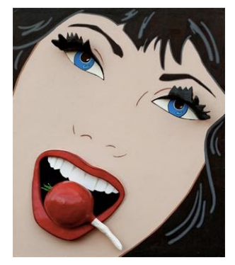
Marjorie Strider, Girl with Radish

The cost for each presentation is $25 for CAS members and $30 for the general public; a subscription to all three tours is $65 for members and $80 for non-members.