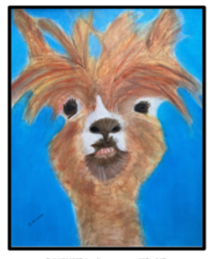
"UNKEMPT" Acrylic on canvas, 25" x 21"