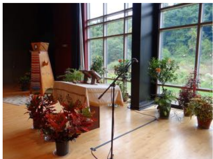
A few photographs from past High Holy Day services at Berkshire South Regional Community Center.