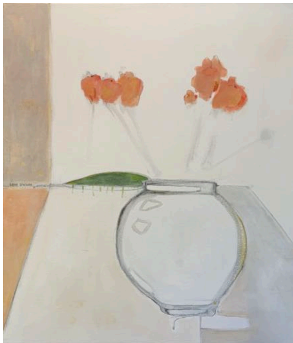
"The White Space Between Me, You, and My Dying Tulips"