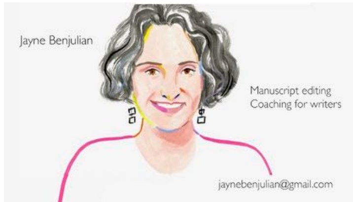
Our newest advertiser