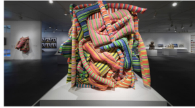
Installation view of Marta Minujin: Arte! Arte! Arte! at the Jewish Museum, NY