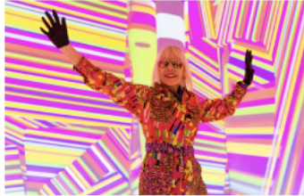
Marta Minujin inside Impulsión , Pinacoteca de São Paulo, 2003