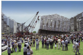
El Participo de Buenos (The Participo of Buenos Aires), 1963, Marta Minujin