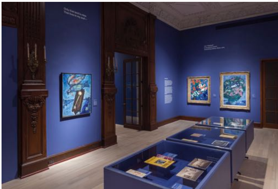
Installation view of the exhibition Chagall: Love, War and Exile. The Jewish Museum, New York.

The voice of the artist rings loud and clear as he links his controversial images to specific events: Berlin anti-Semitic riots (1930), Hitler's takeover (1933), deportation of Polish Jews (October 1938), Kristallnacht (November 1938), massacre of the Vitebsk Jews (1941), among many other Holocaust horrors. Seen here, his work using the crucifixion dates from the early masterpiece, Calvary (1912), to late in his career, In Front of the Picture (1971). Questions immediately arise: why did Chagall use this potentially painful symbol of the Jews persecutors to symbolize Jewish suffering itself?