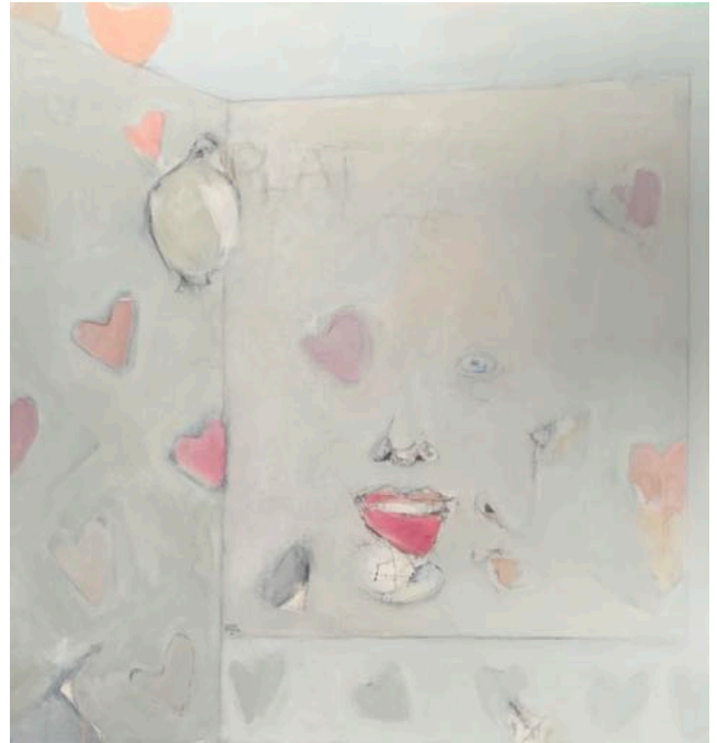
Plat. We're Not Sad. An Occasion For Lunch Time To Eat.