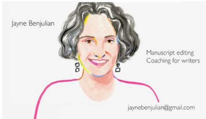
Our newest advertiser