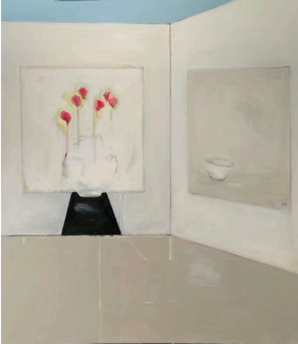
Embodiment. A painting Of Two Paintings Make Three Calling Me Forth.